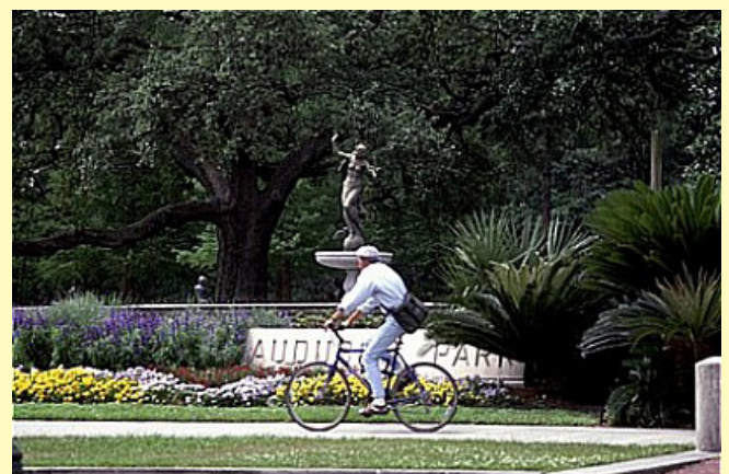
Audubon Park photo