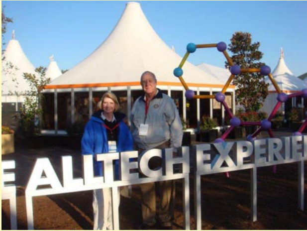
PHOTO COLLAGE OF THE ROTARY-WEG TEAM