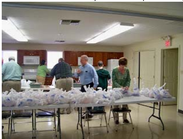
Rotarians volunteering at the backpack program.