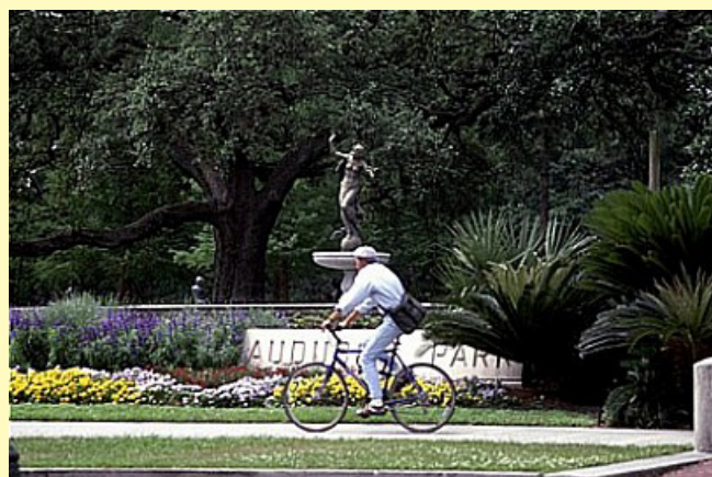
Audubon Park photo