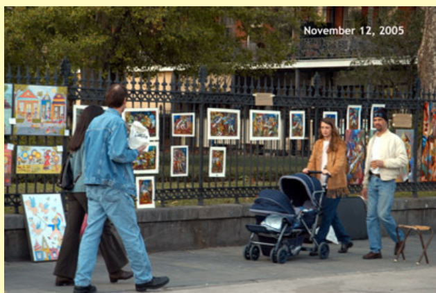
Jackson Square Art photo

You’ll find beautiful art on buildings, street corners, in city parks and in public gardens.